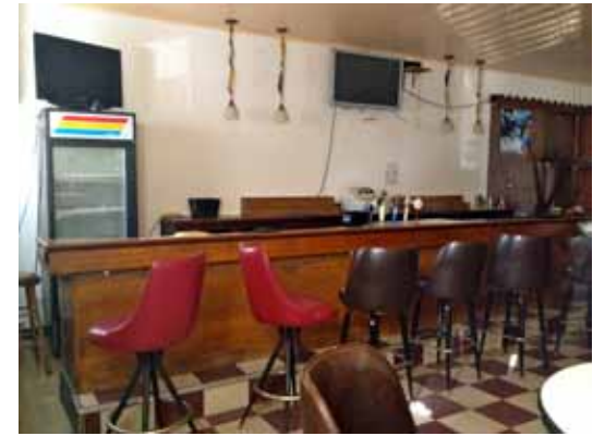
The current interior of the former Marooney's Bar that will become the Bulldog Pub & Grill. It is under renovation and expected to open in October of 2012.