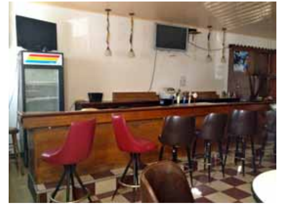
The current interior of the former Marooney's Bar that will become the Bulldog Pub & Grill. It is under renovation and expected to open in October of 2012.