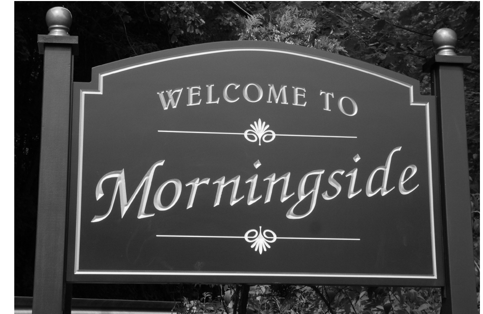
One of the new signs gracing the entrances to Morningside.