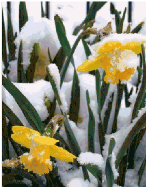
Snow won't hurt spring bulbs.

are extremely hardy and will be unharmed. Larger flowers such as daffodils and tulips will survive snow and frost, unless the temperature dips below 30° for several days. In cases of extended cold, pick fully opened flowers and enjoy them in your house. Unopened buds should survive late cold snaps with little or no damage.